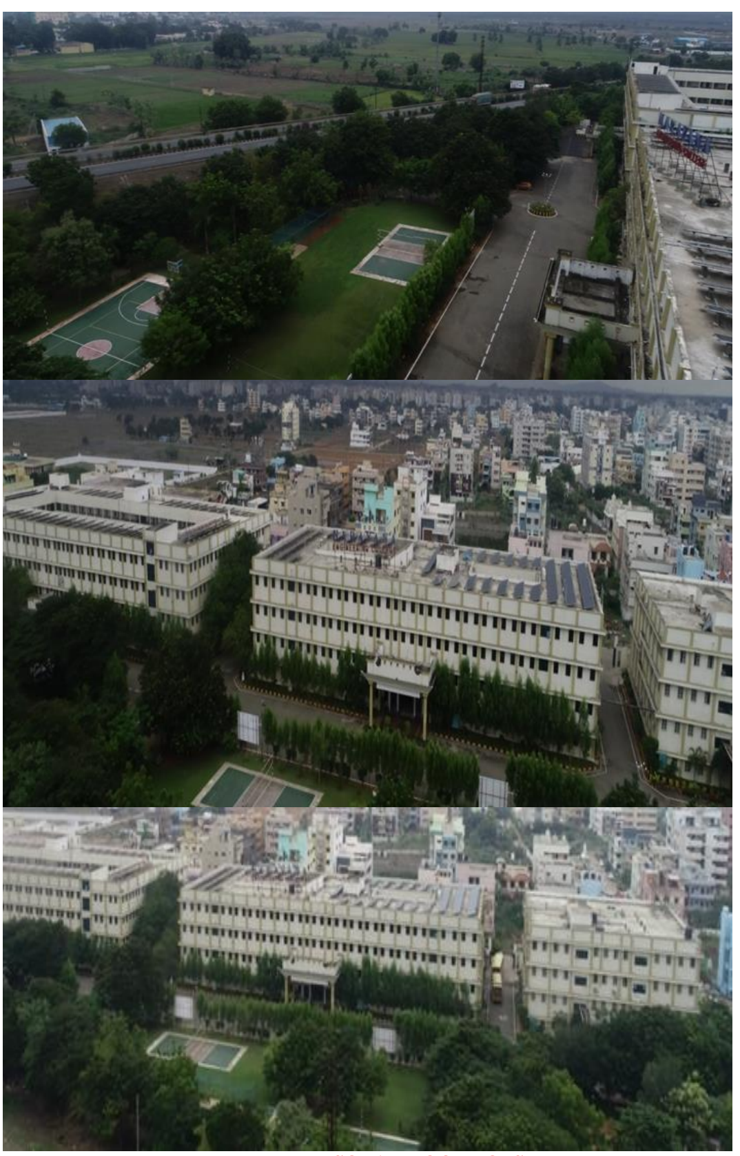
SOLAR ROOF TOPS