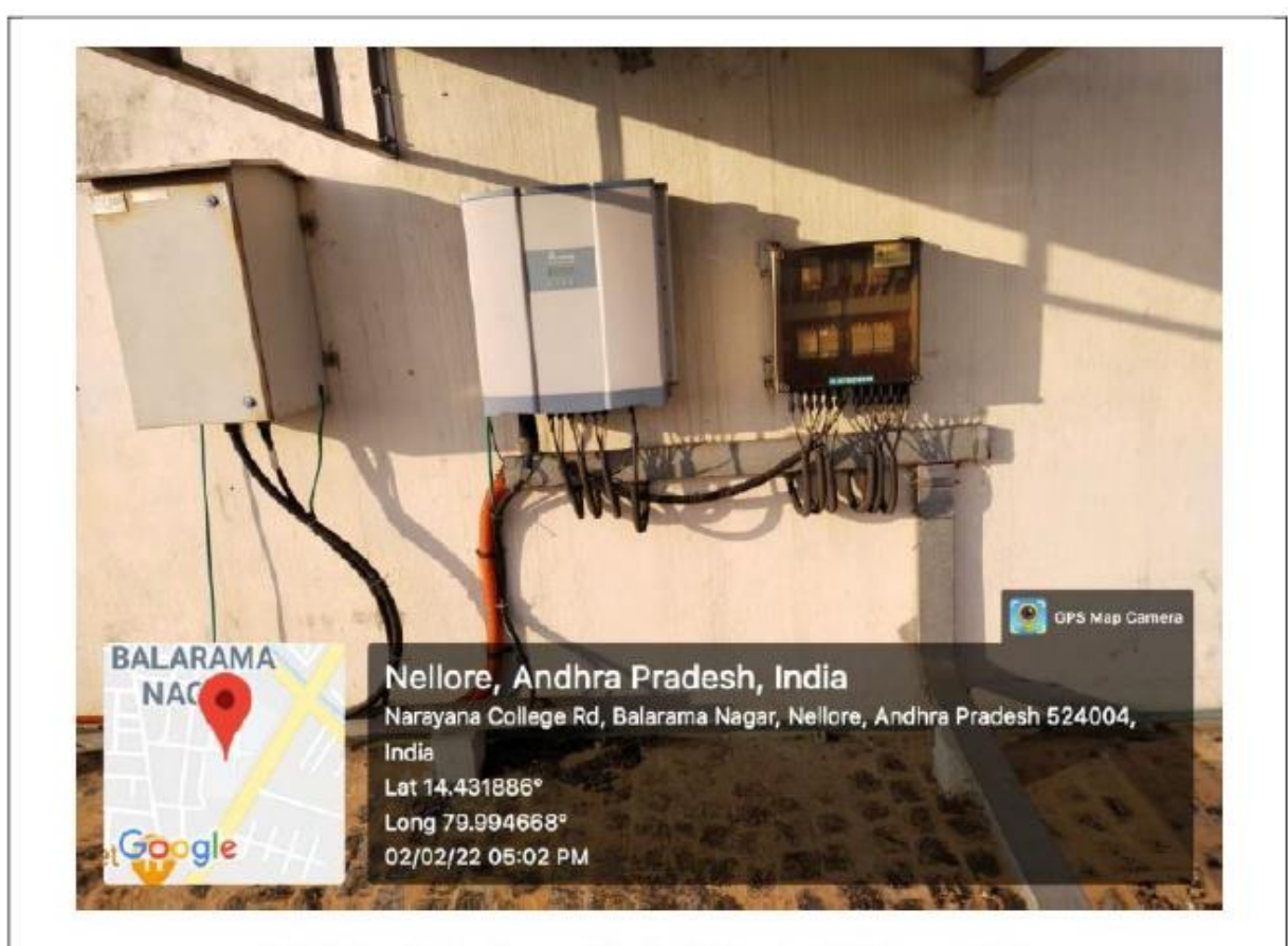
Roof Top Solar Power Plant at Charles Babbage Block