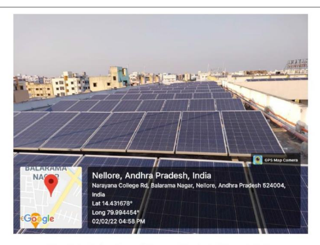
Roof Top Solar Power Plant at Charles Babbage Block